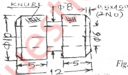
Fig. No. 1